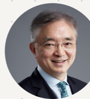
Andrew Young Advisory Committee